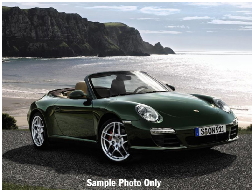
Sample Photo Only

VIN: *****754641 Stock ID: 9023 Mileage: 0 Transmission: 6-Speed Manual Exterior: Black Interior: Black Standard Leather Price: $107,345.00 USD